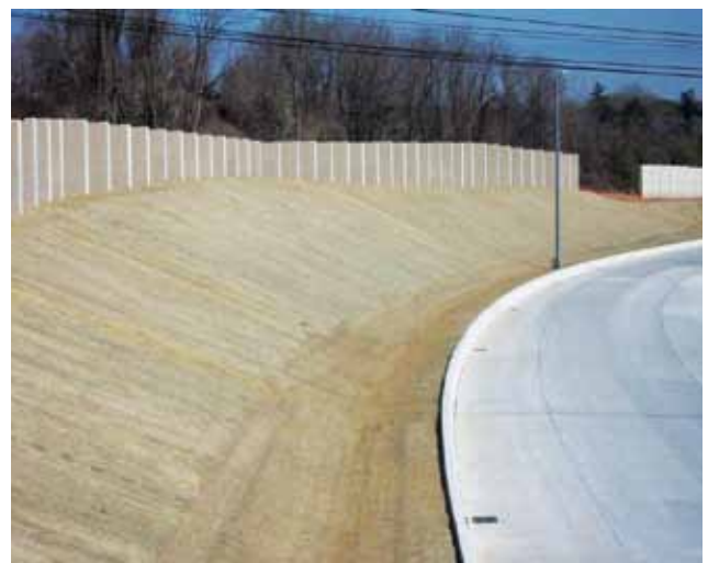
Left: U.S. 202, looking across both lanes of traffic. Right: RECPs assisted in the stabilization of the soil and seed installed, successfully providing grass growth along the entire corridor under construction.