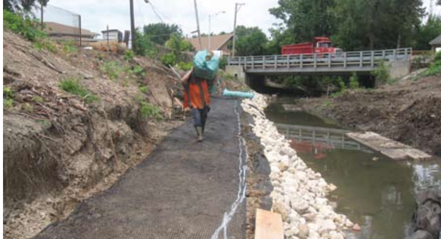
Workers installed geogrids on select stretches of Silver Creek.

The steep slopes along the creek corridor and heavily eroded banks made traversing the work area difficult by foot and nearly impossible by machine. Additionally, permit restrictions on construction activity required that no equipment could operate in flowing water. The contractor on the project, Encap Inc., Sycamore, Ill., used a variety of innovative techniques to construct the project. Through the use of temporary piped stream crossings, benched access routes and heavy-duty timber mats to keep equipment out of the flowing water while constructing the project, workers were able to complete the work efficiently while still