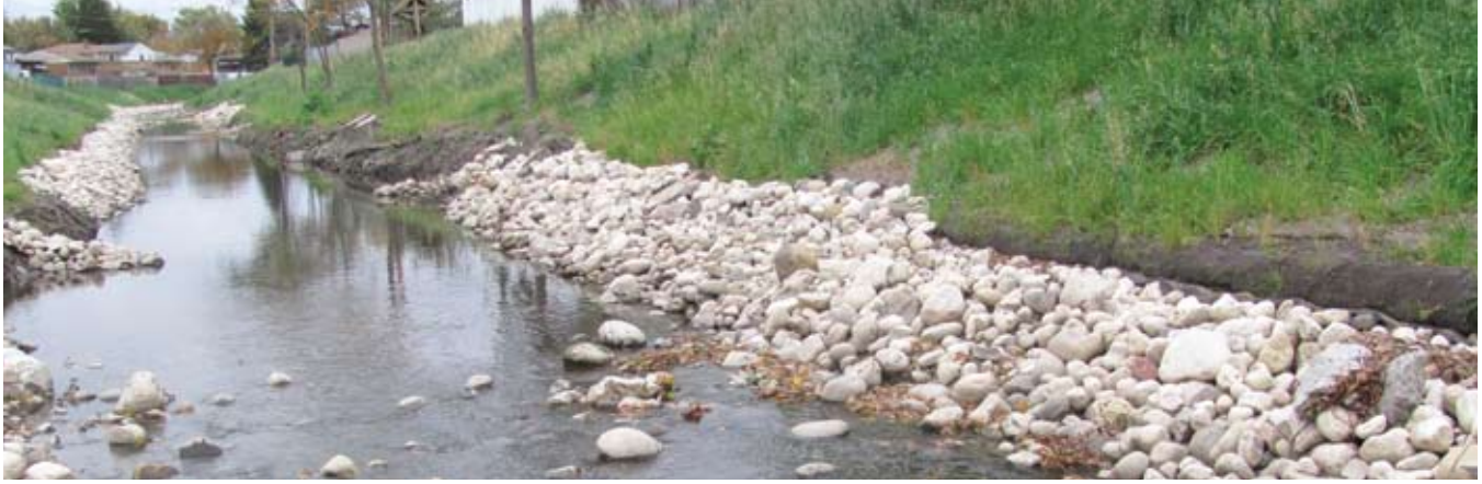
The streambank solutions have withstood heavy rainfall while meeting project goals.