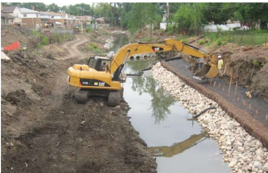
The Silver Creek Phase III project comprised many streambank stabilization solutions, including soil lifts.

The variety of practices implemented on this project was necessary to ensure that the challenging conditions imposed by the stream dynamics and watershed were addressed in a cost-effective way. One existing challenge that had to be addressed was the very limited access to the work area due to encroachment of homes, loss of bank soils and a high density of trees and woody debris along the creek corridor. The majority of the work area was