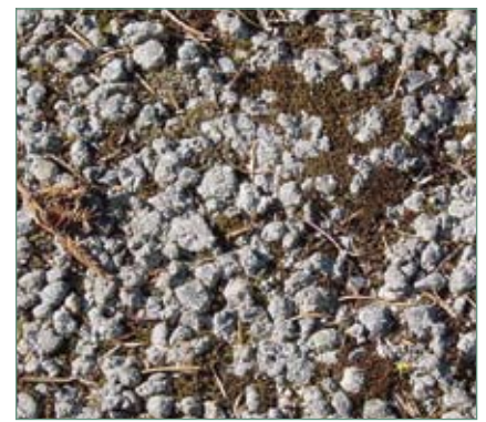
Left: Cleaned pervious pavement. Right: Clogged pervious pavement.