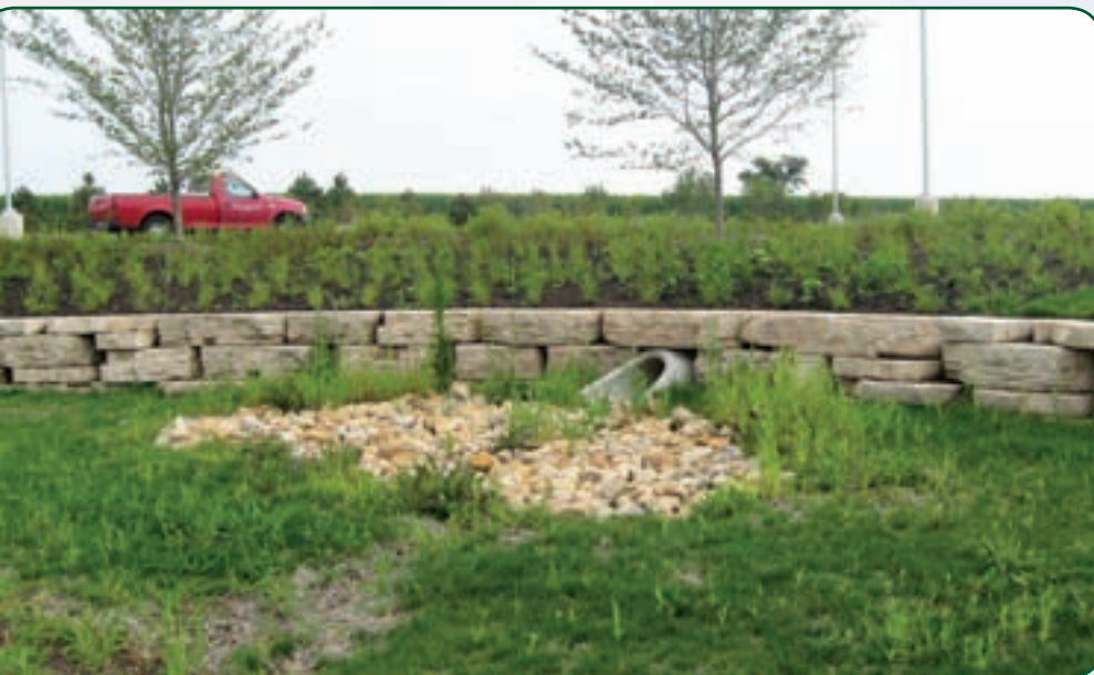
The data center's retaining wall system offered economic, aesthetic and engineering benefits.

Another LEED criterion gives points to projects that use products