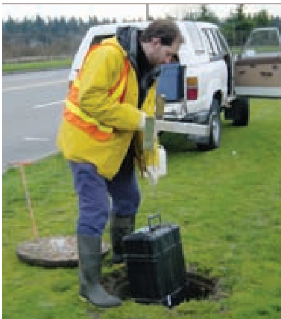
Proper sampler location is key to measurement accuracy and worker safety.

Install automatic samplers on the cutting side of streams so that sand does not bury the sample collection tubes. Where practical, collect samples at the horizontal and vertical center of a stream or run. Sampling at mid-stream and mid-depth is standard practice