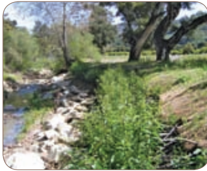
Caltrans plans to pilot more streambank stabilization projects to establish uniform standards.

by adhering to Caltrans' standard specifications and conditions contained in the National Pollutant Discharge Elimination System (NPDES) permit.