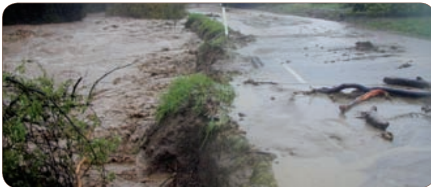
Rincon Creek experienced frequent flooding and erosion.

All drainage systems were upgraded to meet current hydraulic standards. The contractor controlled temporary construction site water quality impacts