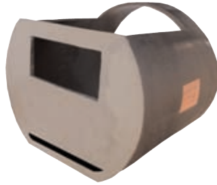
Patent # 2004-0056220A1

Red Valve's patented First Flush Valve is designed for stormwater metering by controlling the "first flush" of a heavy rainstorm. The valve slows the initial downpour of rain by holding back the preliminary high volume of water.