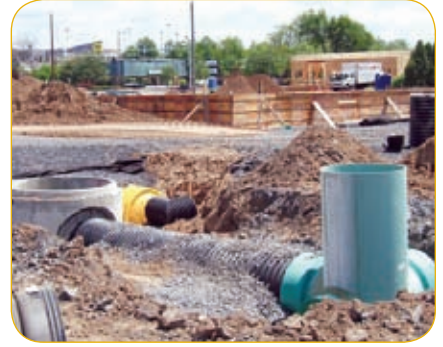
Contractors install water quality units to pretreat retention beds.

water design criteria while preserving valuable onsite real estate. "It was determined early on in the project," said Sadler, "that storm water treatment and detention would have to be achieved using a subsurface system."