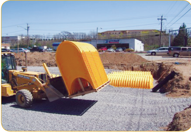
StormTech chambers fit the site's limited zone.