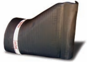
Patent # 5,931,197

Combined sewer and sanitary sewer overflow systems use Tideflex® Valves to prevent receiving water from backflowing into the collection system or treatment plant. The new flat-bottom TF-1 is designed especially for CSO/SSO mahole installations.